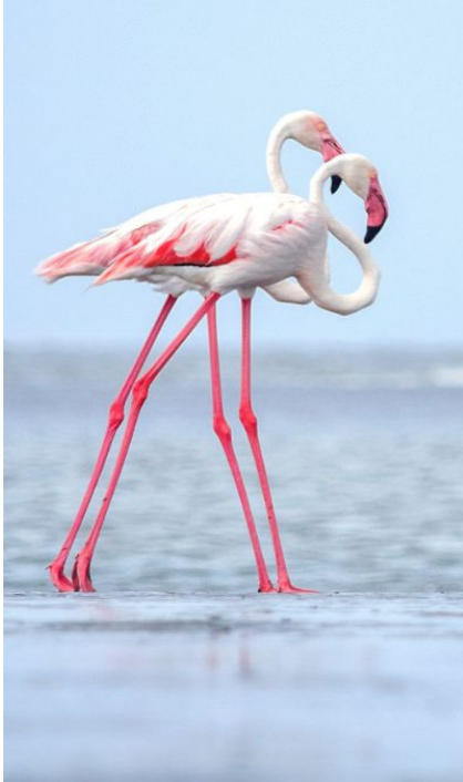
< Flamingoes (Greater Flamingo)